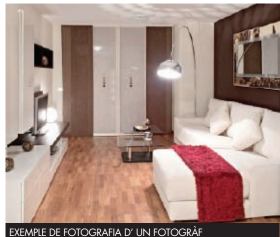
EXEMPLE DE FOTOGRAFIA D' UN FOTOGRAF