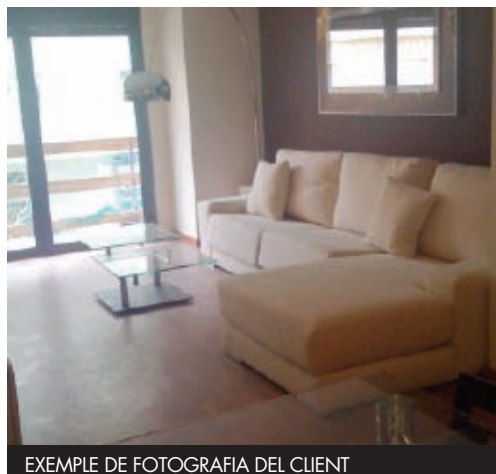
EXEMPLE DE FOTOGRAFIA DEL CLIENT